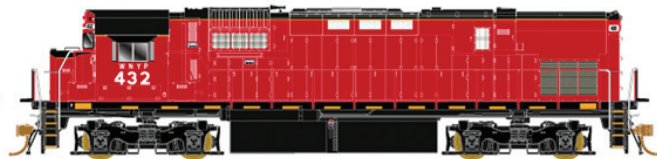
Western New York & Pennsylvania

#23911 Road #3000 #23913 Road #3000 w/snd #23912 Road #3006 #23914 Road #3006 w/snd