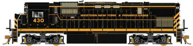
Western New York & Pennsylvania

#23916 Road #431 #23919 Road #431 w/snd #23917 Road #432 #23920 Road #432 w/snd