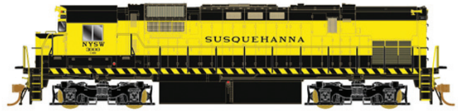
NYSW Later Scheme

#23901 Road #3000 #23906 Road #3000 w/snd #23902 Road #3002 #23907 Road #3002 w/snd #23903 Road #3004 #23908 Road #3004 w/snd #23904 Road #3006 #23909 Road #3006 w/snd #23905 Road #3008 #23910 Road #3008 w/snd