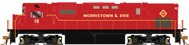
Morristown & Erie

#23921 Road #16 #23923 Road #16 w/snd #23922 Road #17 #23924 Road #17 w/snd