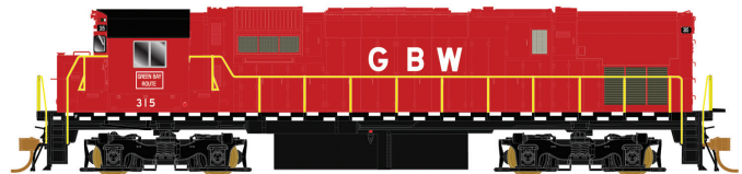
Green Bay & Western

#23921 Road #16 #23923 Road #16 w/snd #23922 Road #17 #23924 Road #17 w/snd