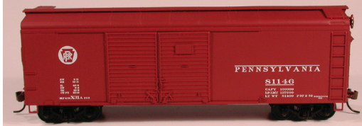
X31 40' Inset Roof Double Door Boxcar PRR Circle Keystone #56931 Road #81146 #56932 Road #81150 #56933 Road #81158