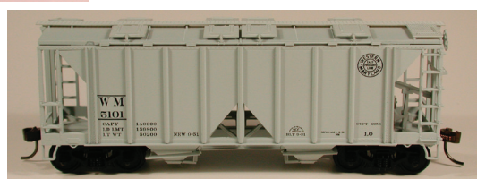
70 Ton 2 Bay Covered Hopper Western Maryland (Circle) #56946 Road #5101 #56947 Road #5125 #56948 Road #5128