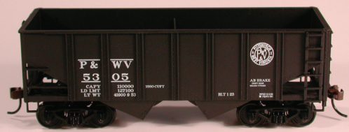
55 Ton U Channel Hopper Pittsburgh & West Virginia #56952 Road #5306 #56953 Road #5312 #56954 Road #5337