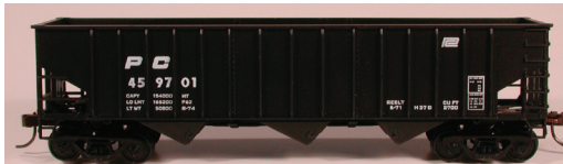
70 Ton 14 Panel 3 Bay Hopper Penn Central #56943 Road #459701 #56944 Road #459723 #56945 Road #459787