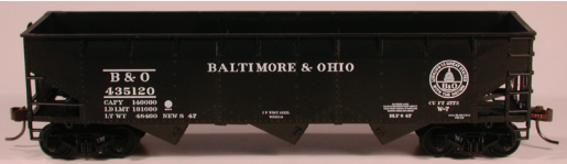
70 Ton 3 Bay Offset Hopper Baltimore & Ohio #56934 Road #435120 #56935 Road #435158 #56936 Road #435172