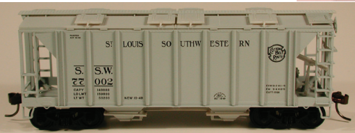
70 Ton 2 Bay Covered Hopper St Louis Southwestern #56949 Road #77002 #56950 Road #77016 #56951 Road #77023