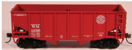
55 Ton Fish Belly Hopper Western Maryland (Circle) #56940 Road #12501 #56941 Road #12523 #56942 Road #12569