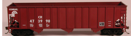
100 Ton 3 Bay Hopper Conrail #56955 Road #473998 #56956 Road #474868 #56957 Road #474037