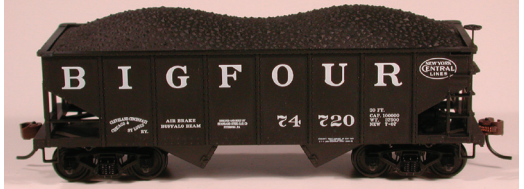
2 Bay Hopper GLa Type CCC&StL "Big Four" #56937 Road #74720 #56938 Road #74727 #56939 Road #74743