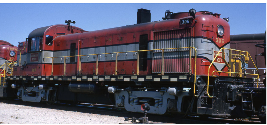
Photo: Kewaunee, WI 6-20-64