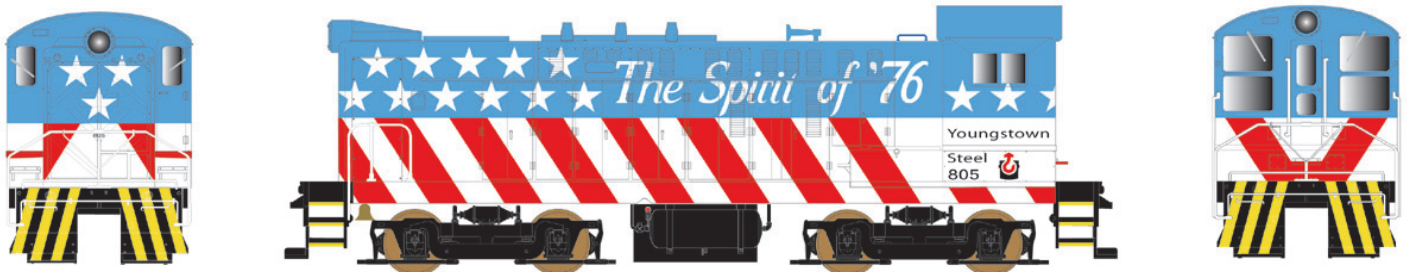
Youngstown Steel Bi Centennial (S-8) #23974 Cab #805 $189.95 each #23975 Cab #805 w/dcc/snd $289.95 each