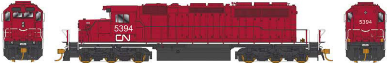
#24451 Cab #5394 Analog

Canadian National (ex Ontario Hydro) 102" Nose, Corrugated Radiator Grill Covers, Ditch Lights, Class Lights Removed, Dual Flag Red