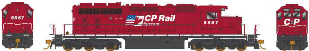
#24455 Cab #5567 Analog

CP Rail Dual Flag Scheme 81" Nose, Double Row of Louvred Doors in Air Compressor Area, Chicken Wire Radiator Grill Covers, Class Lights Removed, Ditch Lights