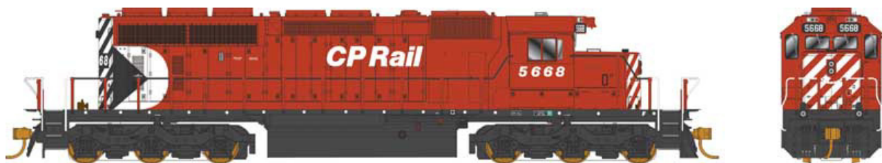
#24461 Cab #5668 Analog

CP Rail Small Multi-Mark 81" Nose 3 Lens Class Light Chicken Wire Radiator Grill Covers, Double Row of Louvred Doors in Air Compressor Area, Ditch Lights