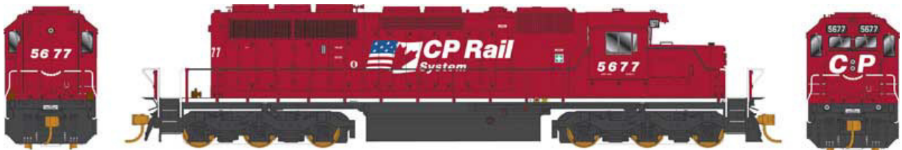
#24459 Cab #5677 Analog

CP Rail Dual Flag Scheme Operated on the D&H, 102" Nose, Class Lights Chicken Wire Radiator Grill Covers, Ditch Lights