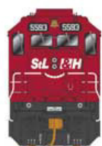
#24509 Cab #5593 Analog